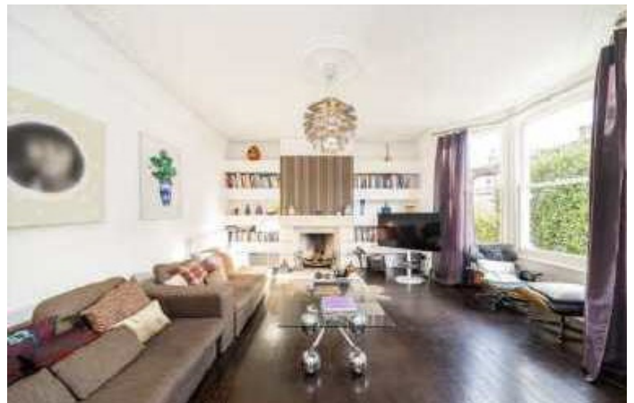
Musgrove Road, SE14