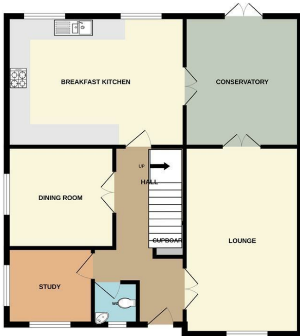
GROUND FLOOR 876 sq.ft. (81.4 sq.m.) approx.