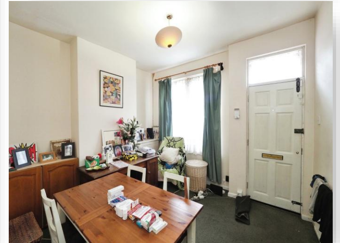
Evington Street, Leicester LE2 0SA