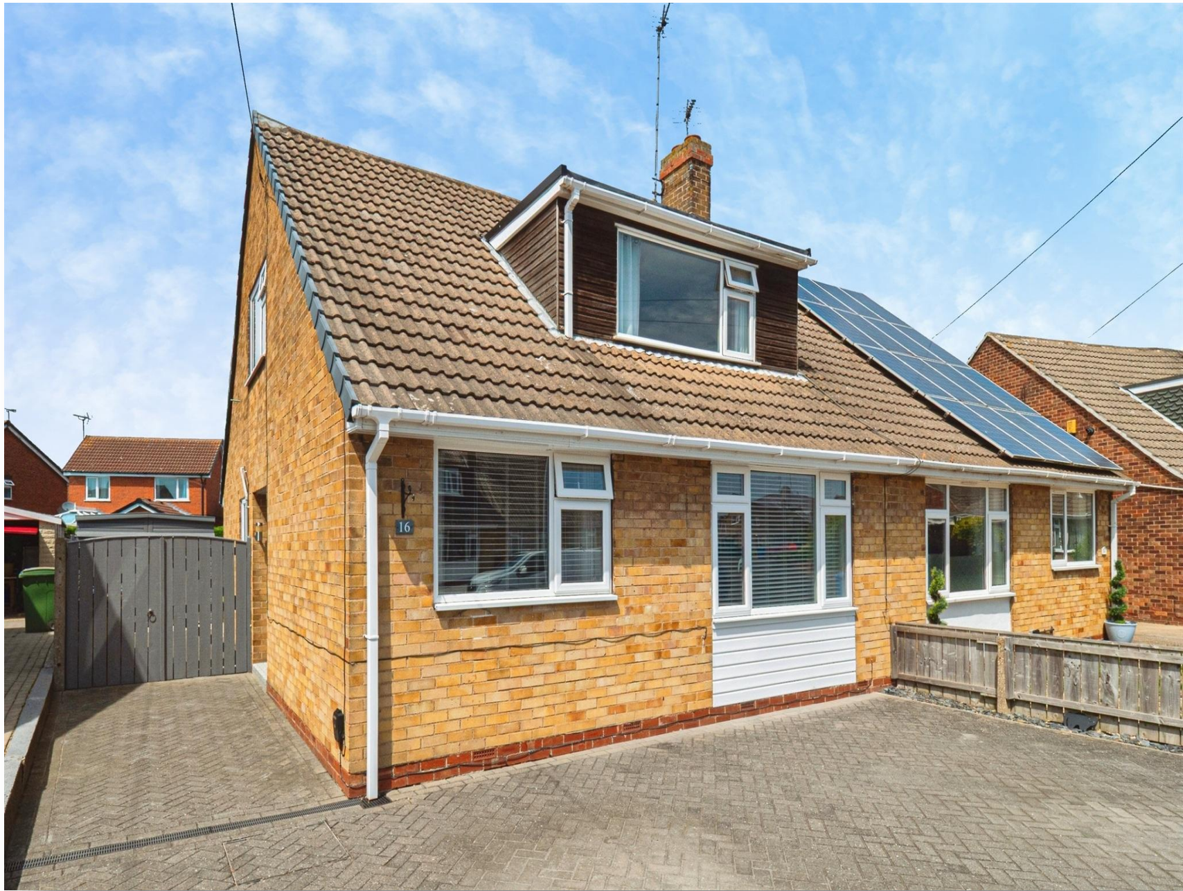
Chestnut Avenue, Beverley, HU17 9RB