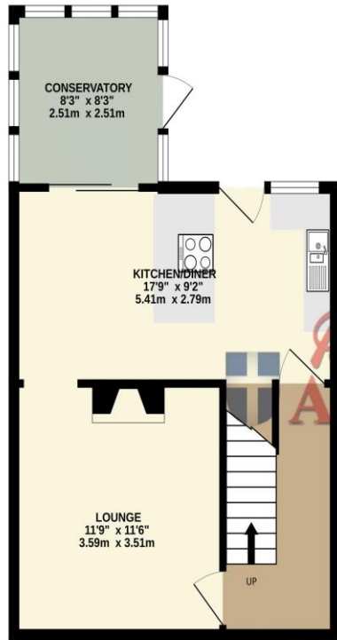
GROUND FLOOR 432 sq.ft. (40.2 sq.m.) approx.