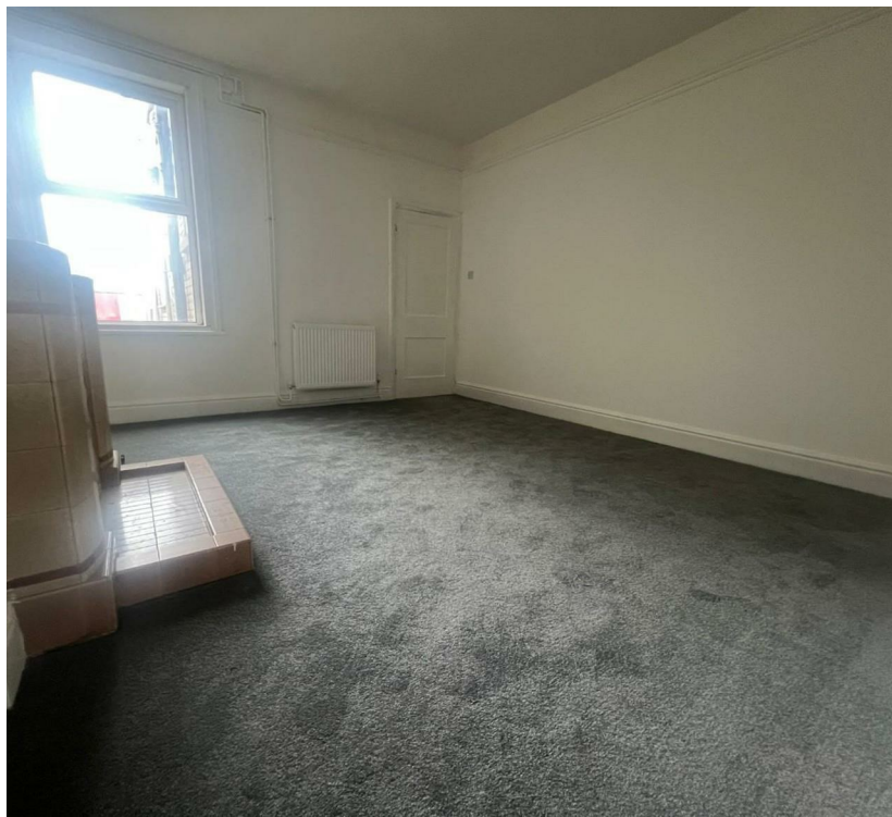
29A Cavendish Street PE1 5EQ