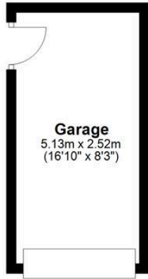
Garage Approx. 12.9 sq. metres (138.8 sq. feet)