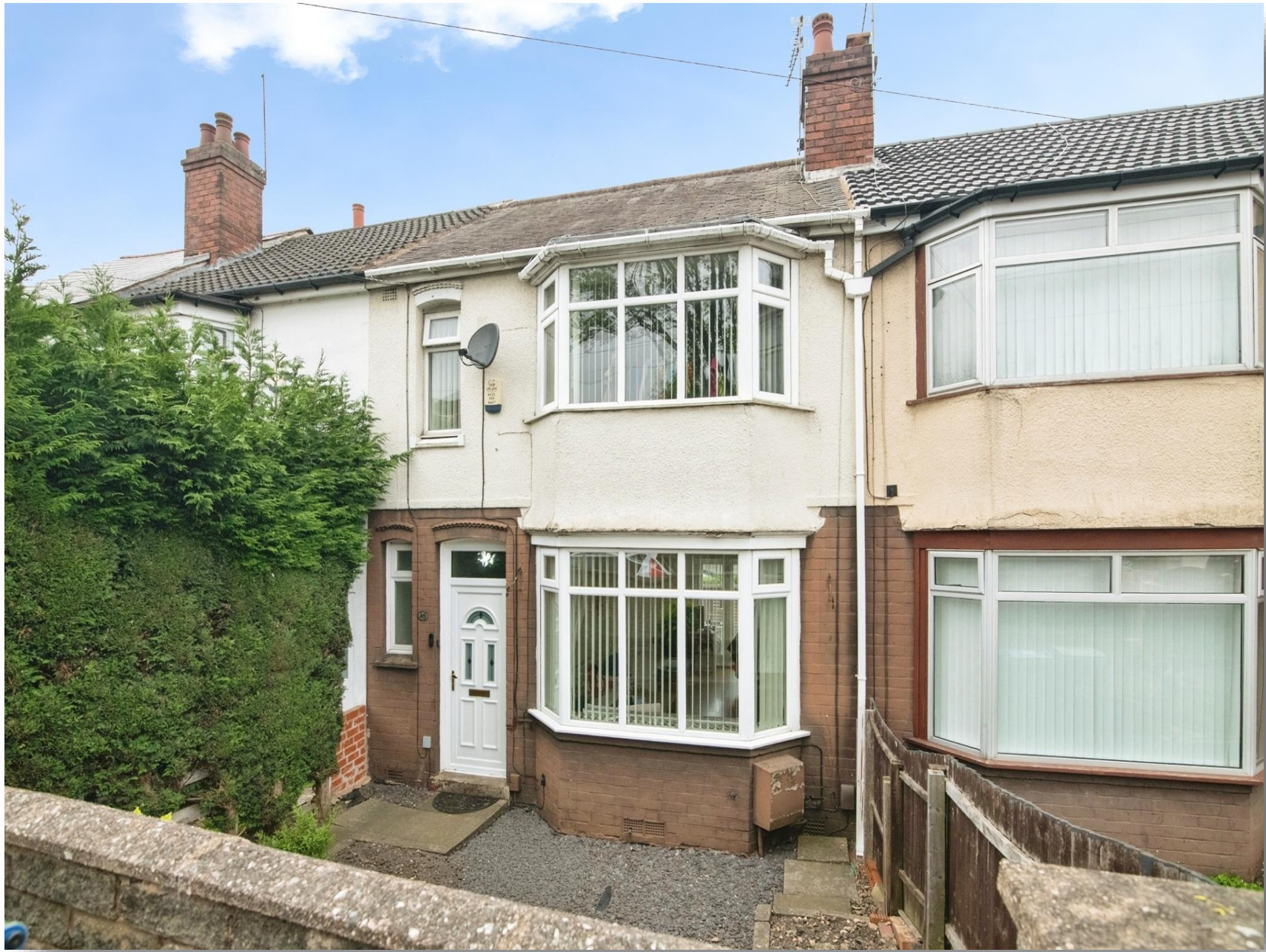
Bilhay Lane, West Bromwich B70 9RS