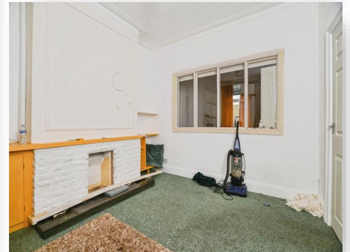
Samuel Street, Stockton-On-Tees TS19 0BU