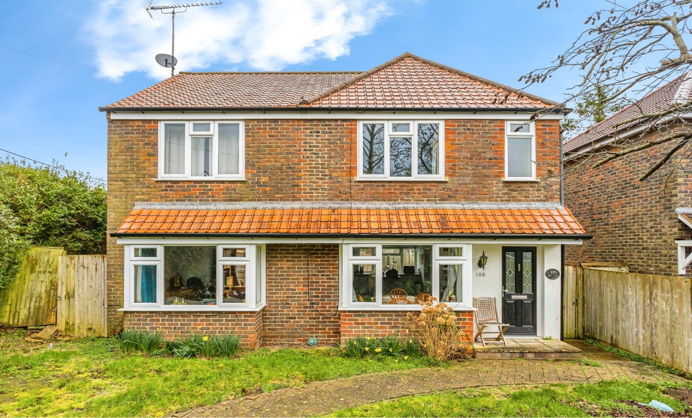
Leylands Road, Burgess Hill, RH15 8AB