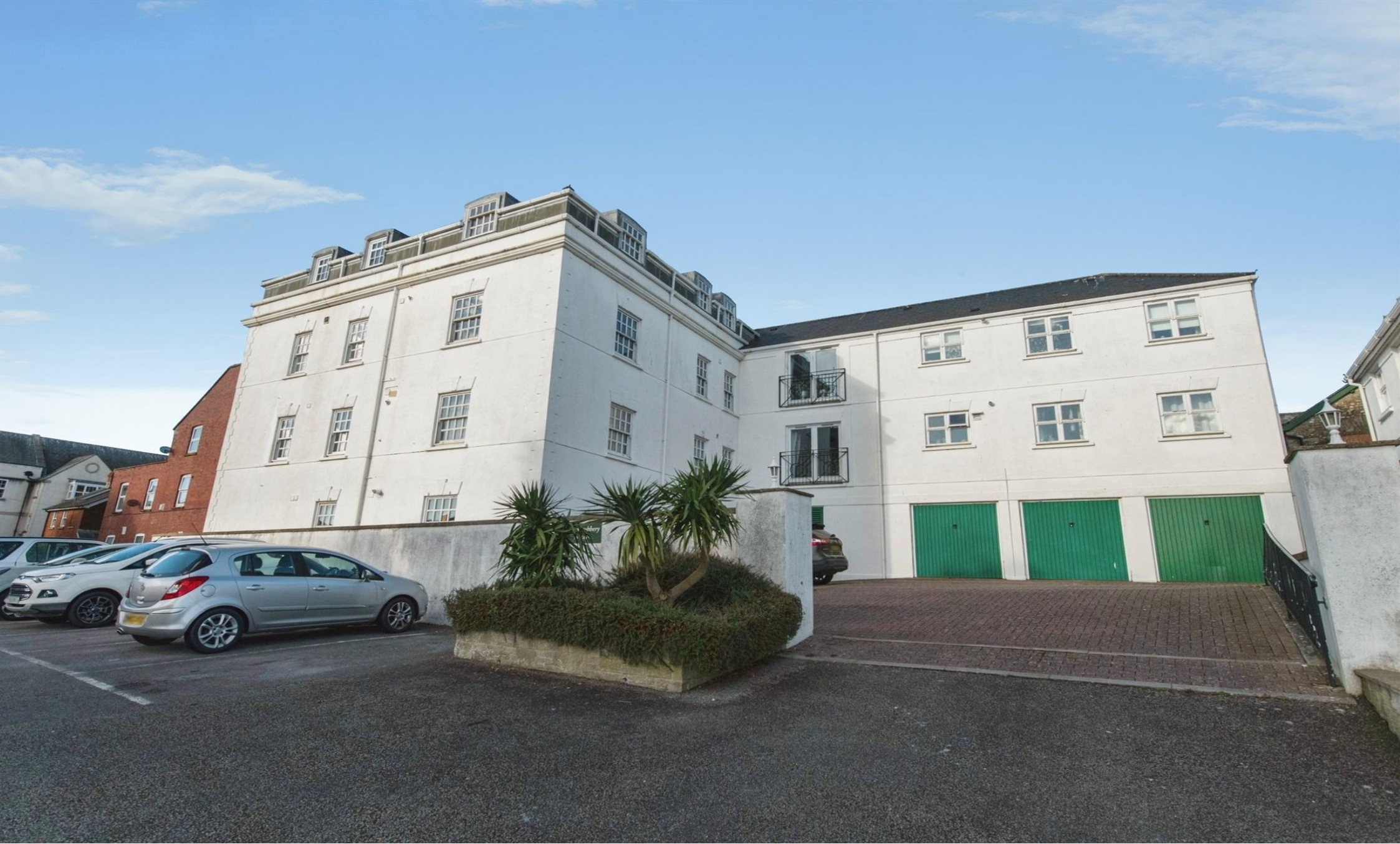
The Shrubbery, West Street, Axminster EX13 5NX