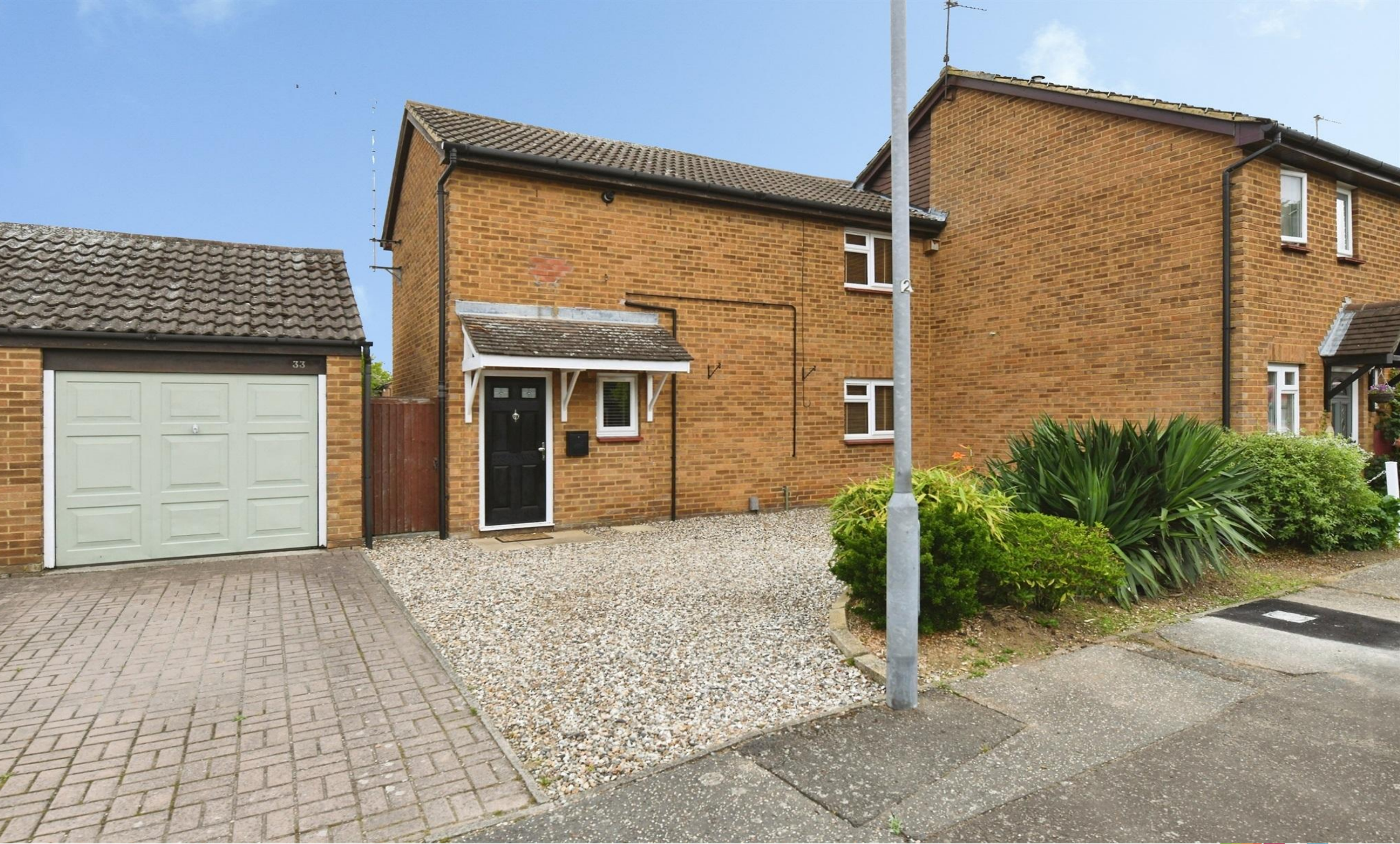
Boulderby Grove, Chelmsford CM1 4XN