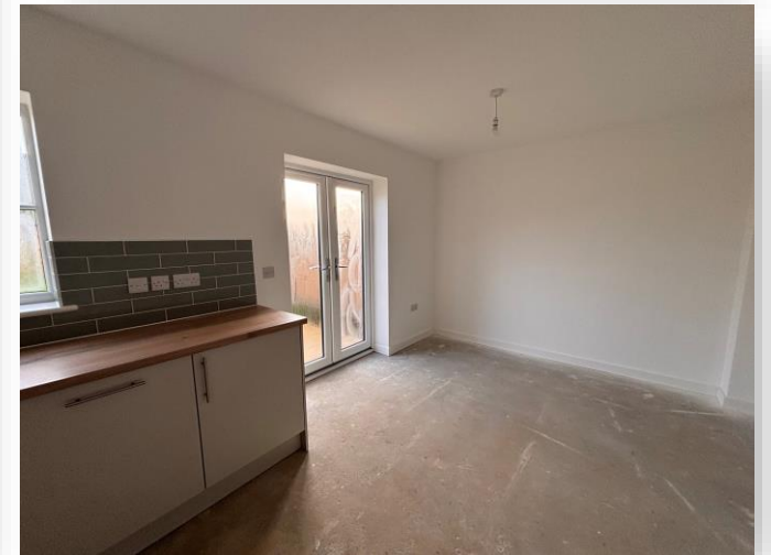
Rose Cottage Church Road, Griston Thetford IP25 6QA