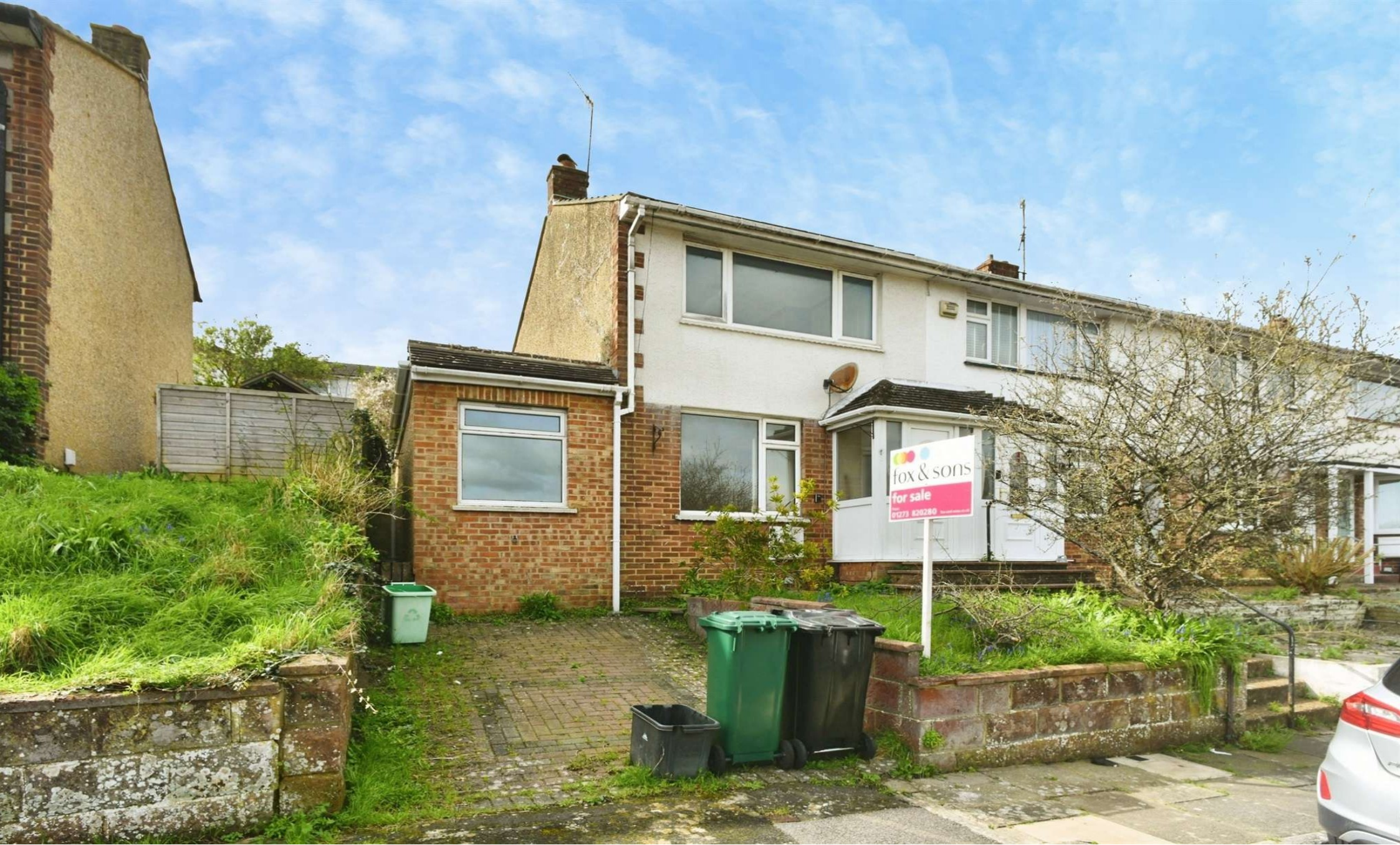
Dean Gardens, Portslade Brighton BN41 2FW