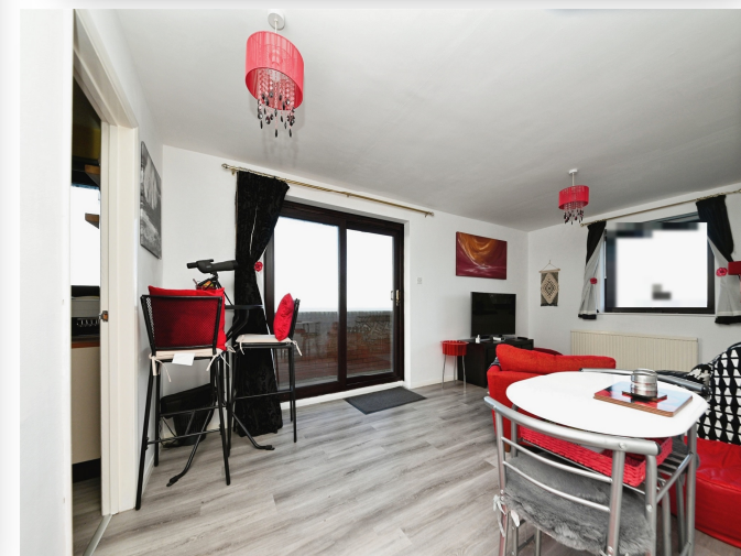
Harlequin House, Le Strange Terrace, Hunstanton, PE36 5AJ