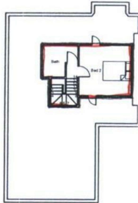
Second Floor Plan Scale 1:200

Disclaimer These particulars, whilst believed to be accurate are set out as a general outline only for guidance and do not constitute any part of an offer or contract. Intending purchasers should not rely on them as statements of representation of fact, but must satisfy themselves by inspection or otherwise as to their accuracy. No person in this firms employment has the authority to make or give any representation or warranty in respect of the property. All measurements and distances are approximate only. Your home is at risk if you do not keep up repayments on a mortgage or other loan secured on it.