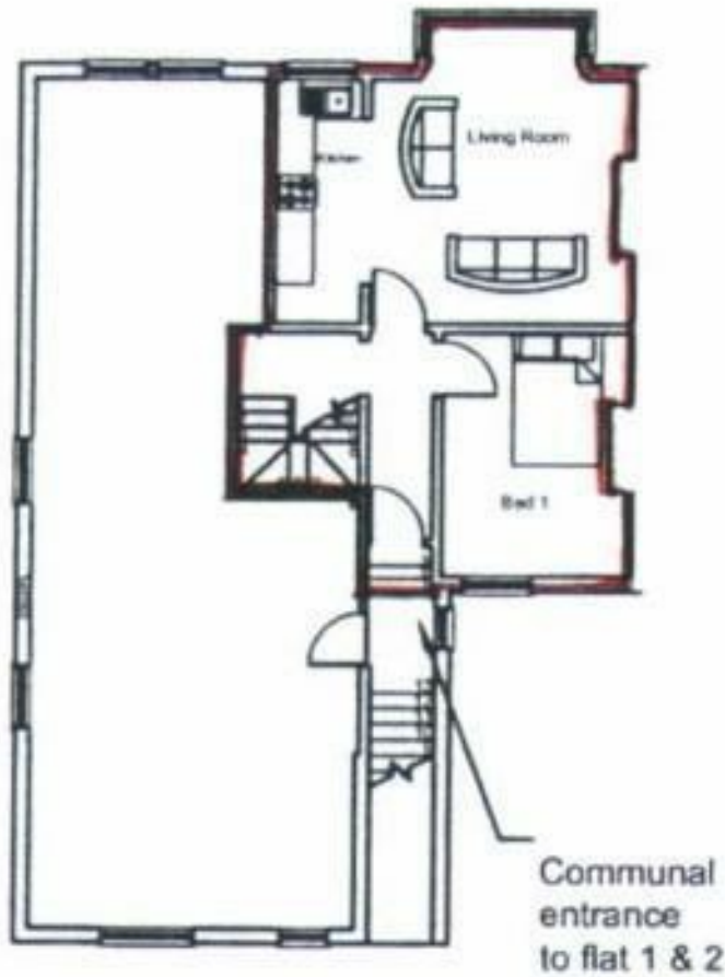
First Floor Plan Scale 1:200