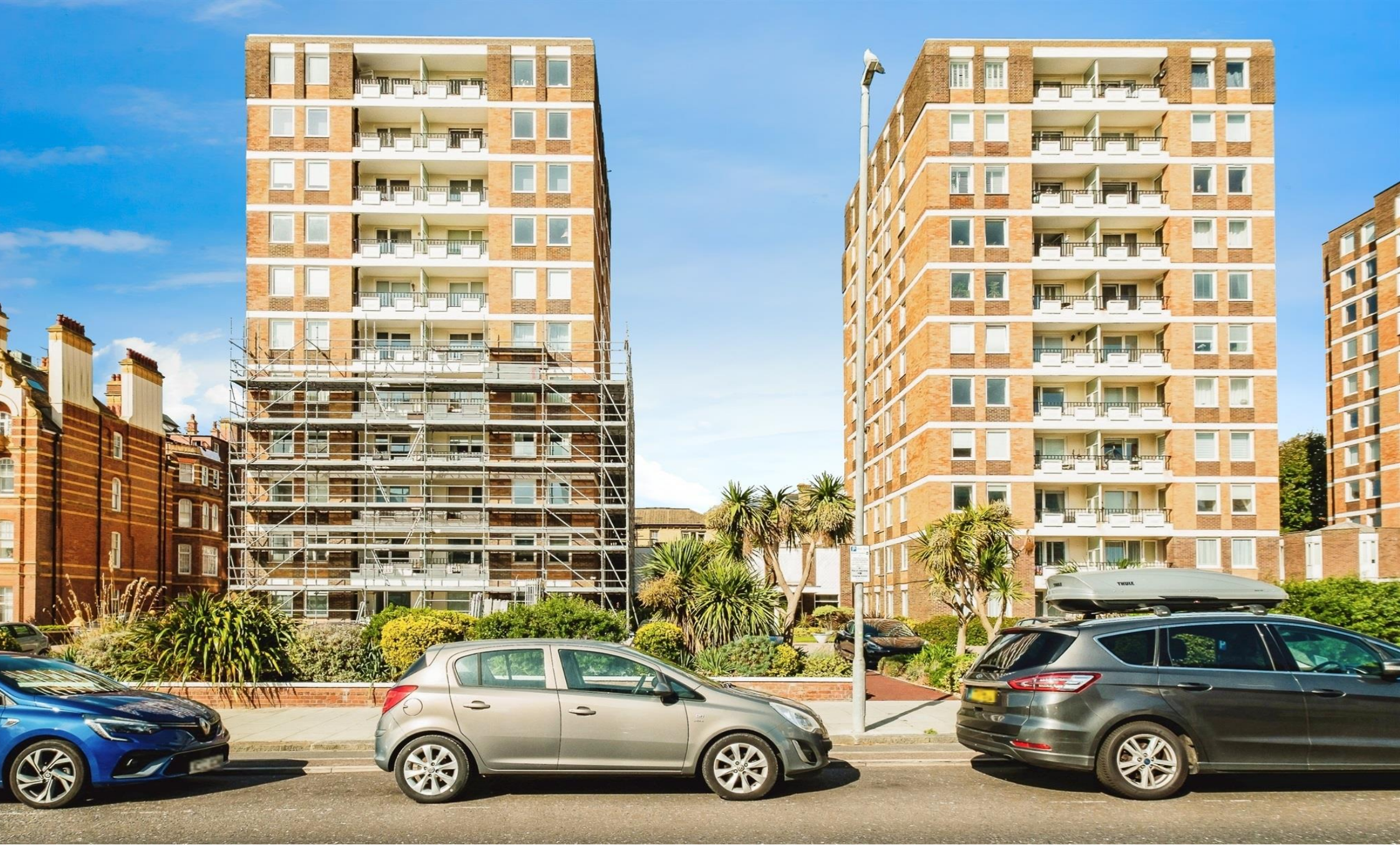
Ashley Court Grand Avenue, Hove BN3 2NQ