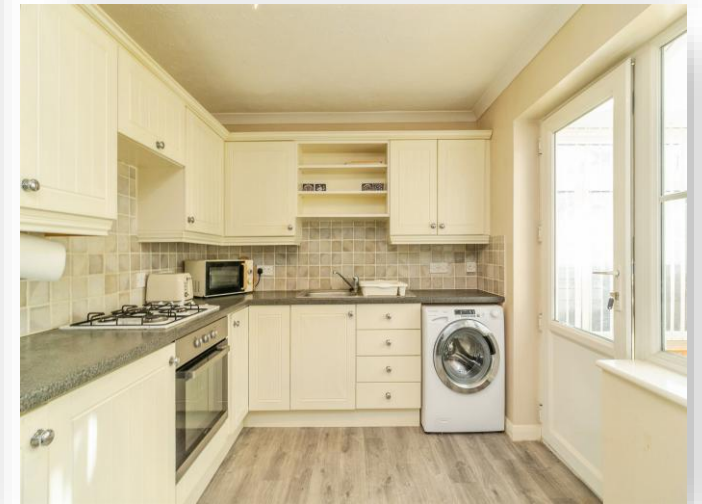
Burgess Gardens, Newport Pagnell, MK16 0NT