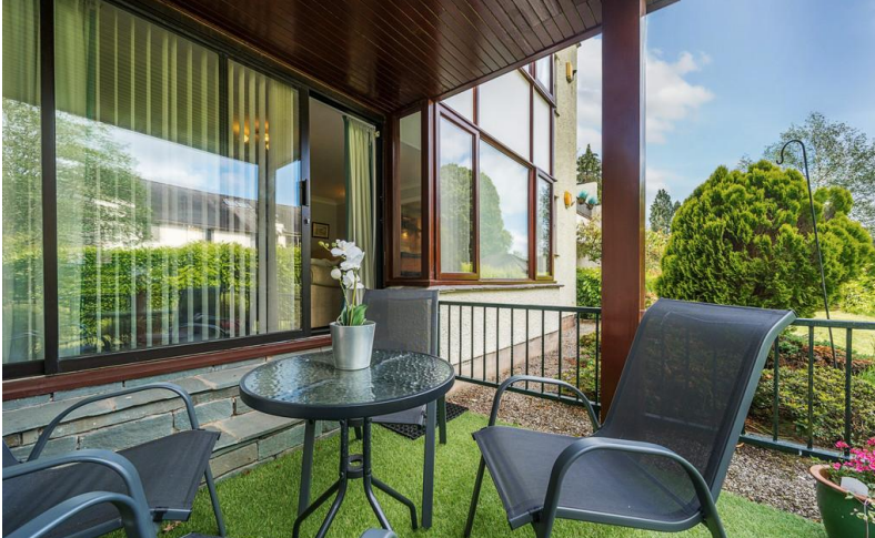
Covered Patio Seating Area