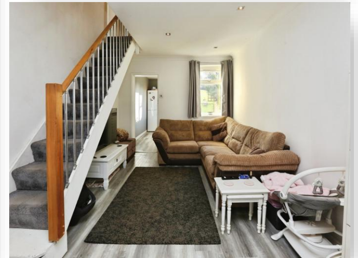
Victoria Place, Gosport, PO12 1SG