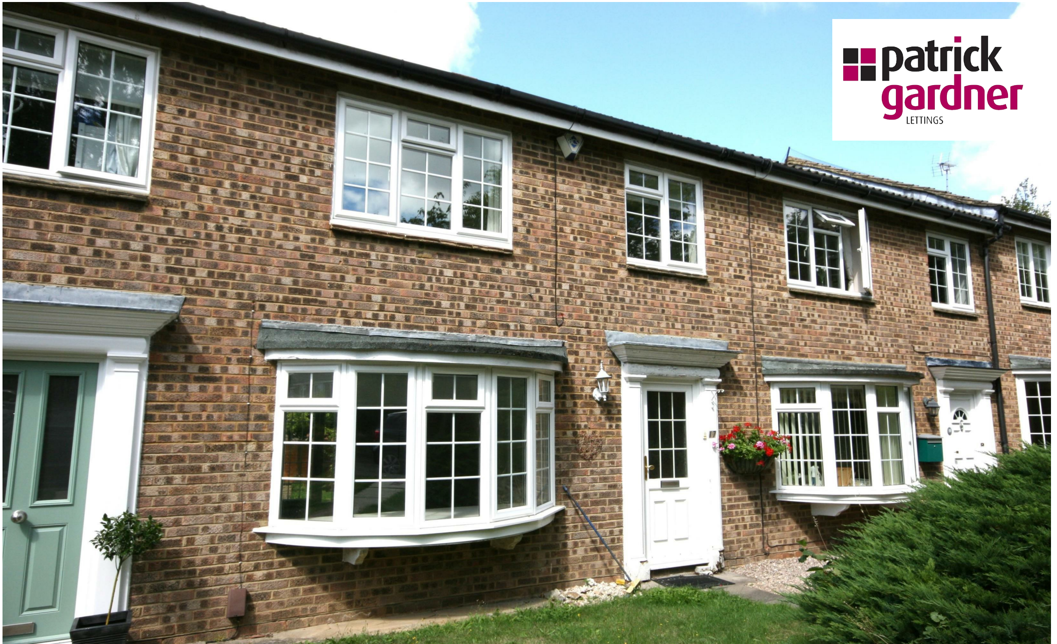
Aquila Close, Leatherhead, KT22 8TY