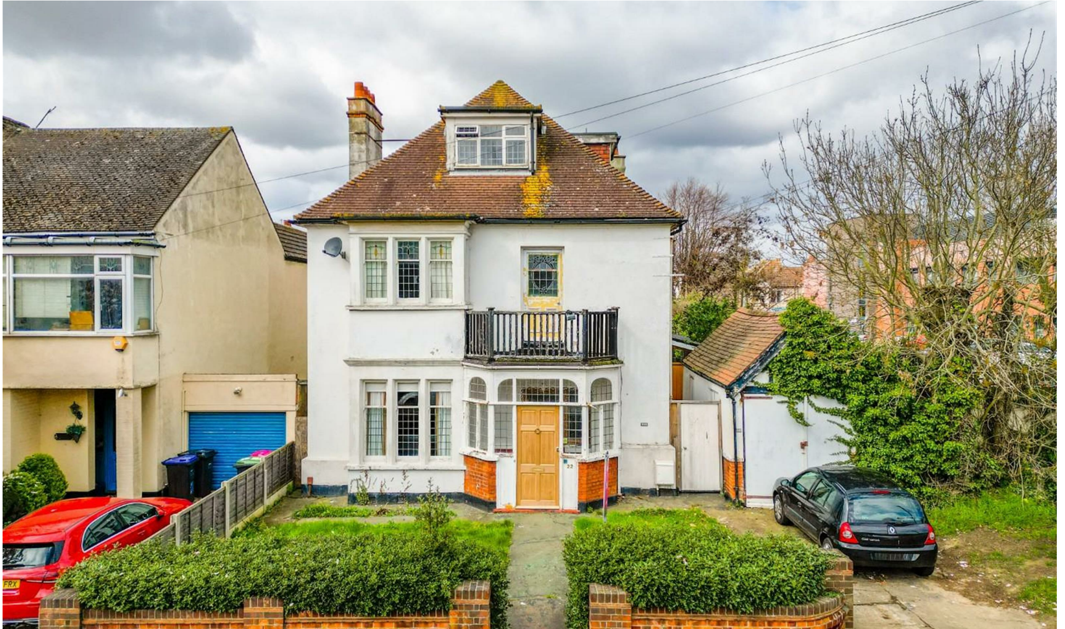
Ditton Court Road, Westcliff-On-Sea £930,000