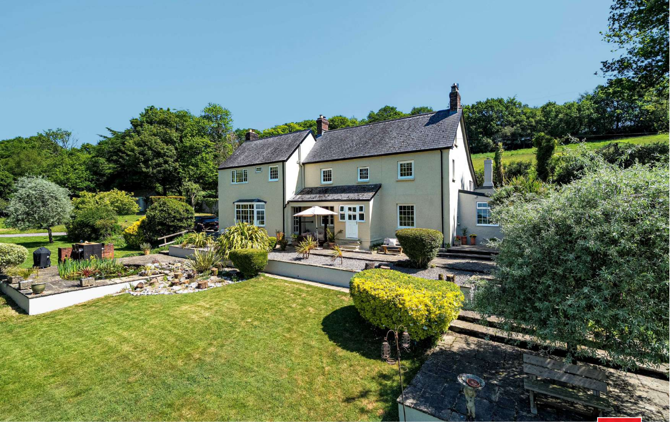
Culm Pyne House Hemyock, Cullompton EX15 3SR