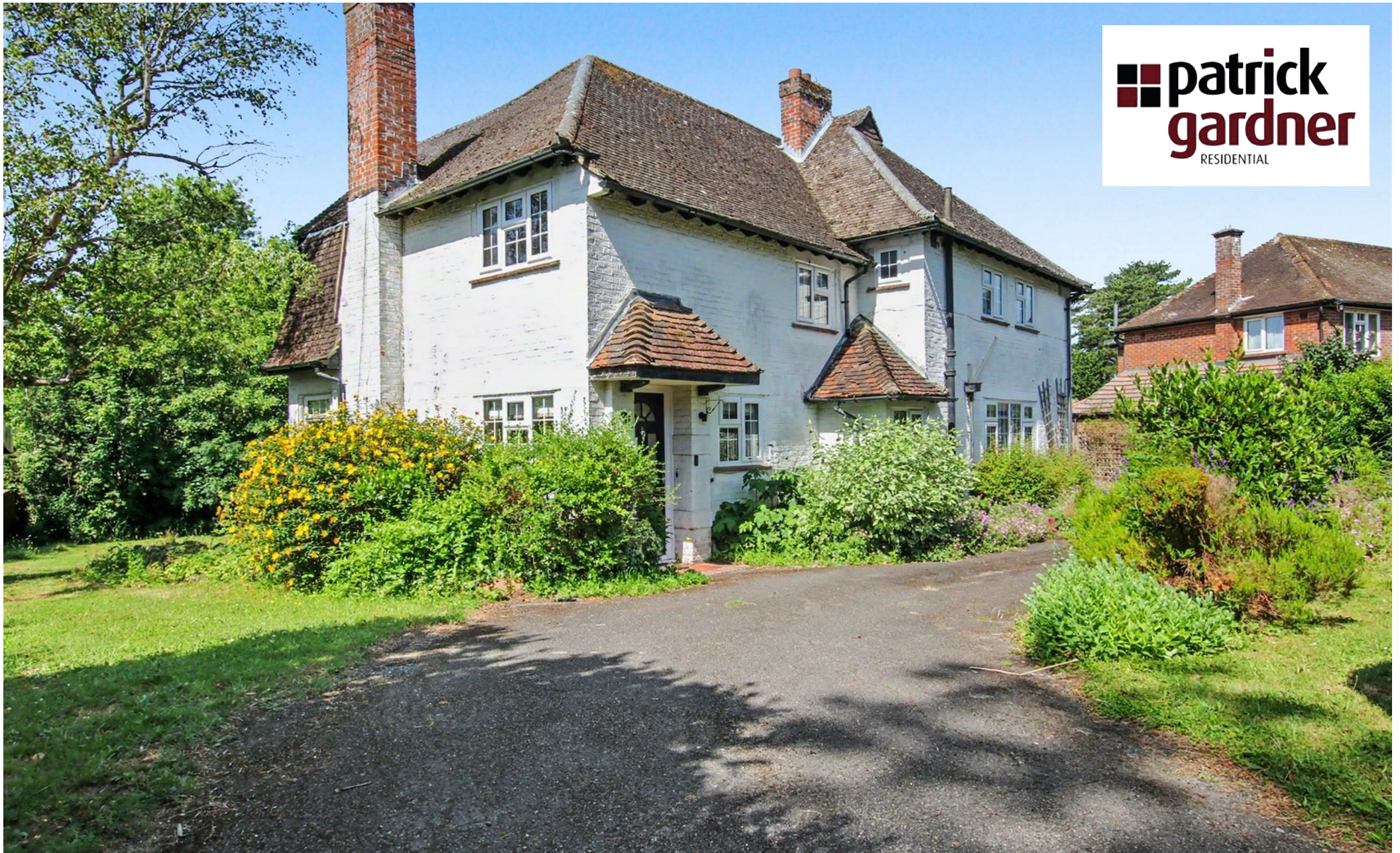
Pemberley The Marld, Ashted, Surrey, KT21 1RW