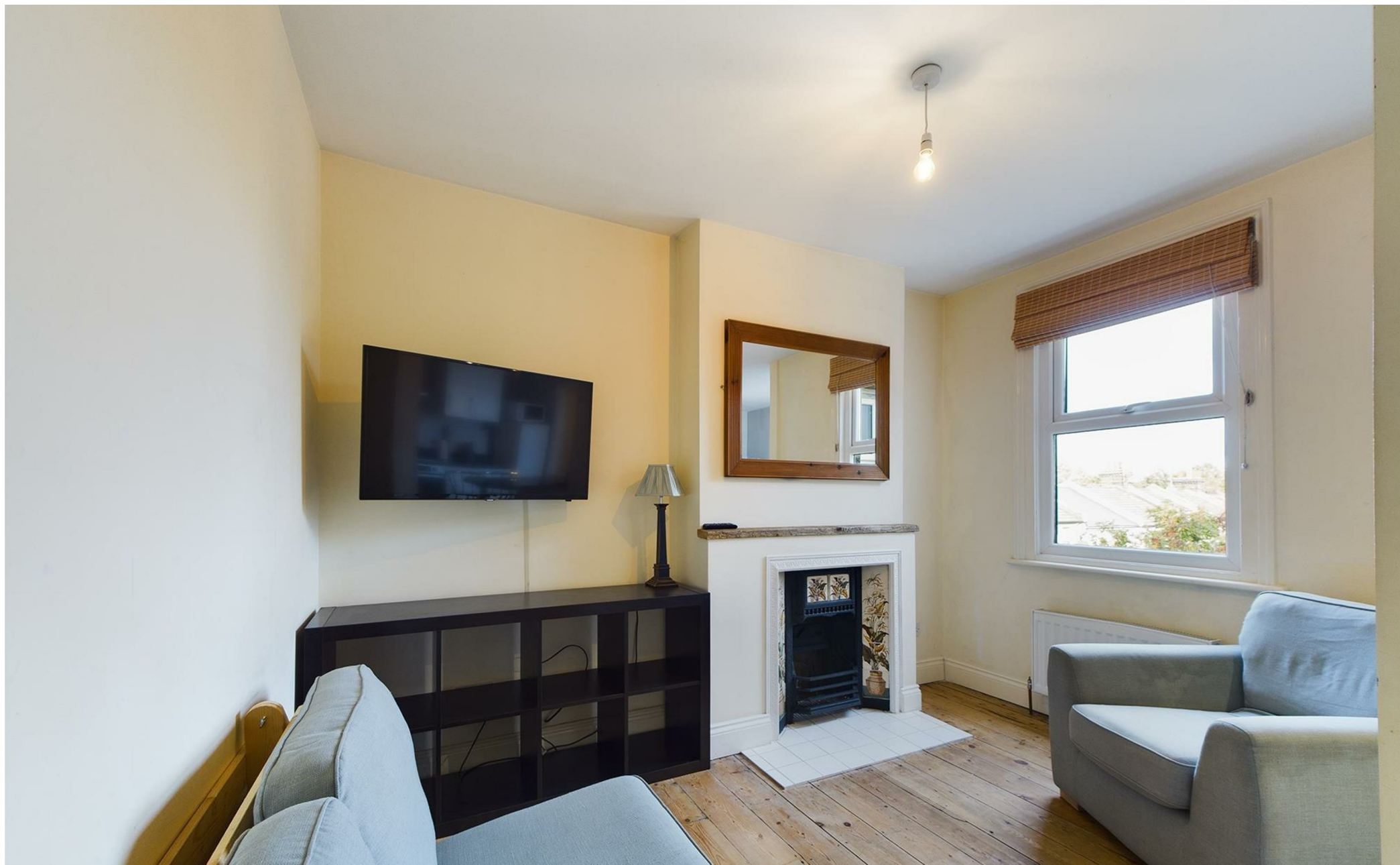
1a Gurdon Road, London, SE7 7RN £355,009