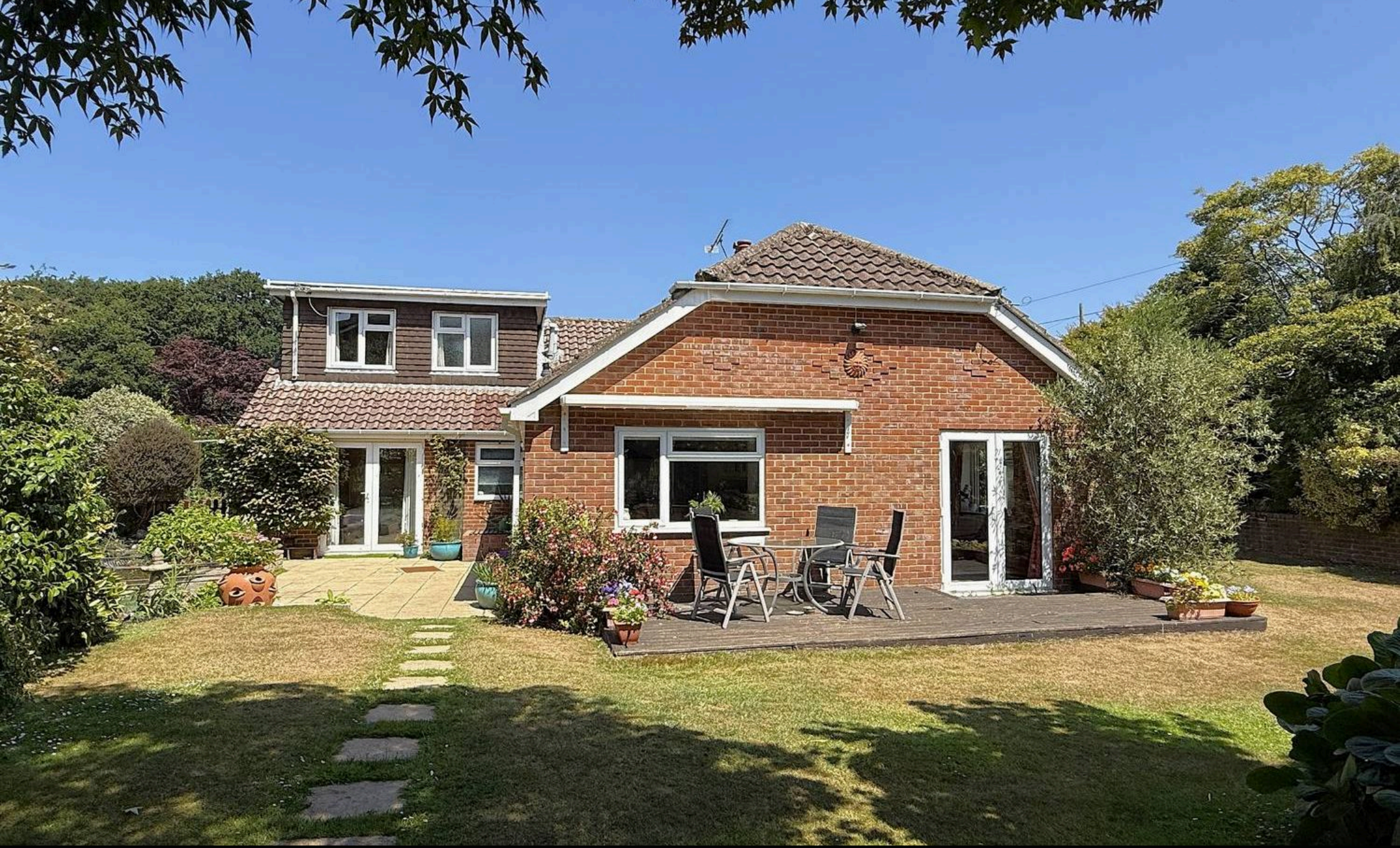
The Glen Stonehills, Fawley, SO45 1DU £679,500