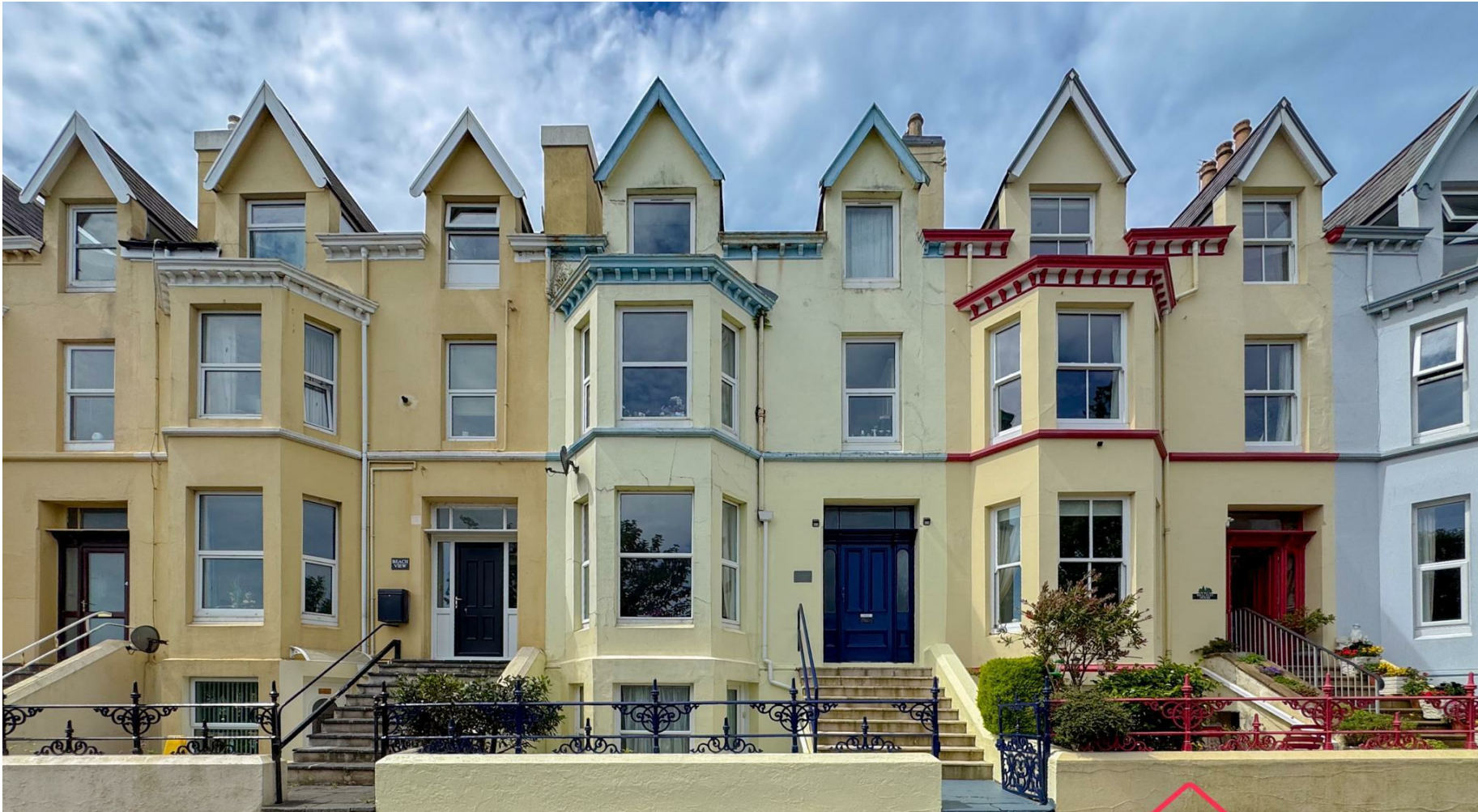
6 Granville Court Windsor Mount, Ramsey, Isle Of Man, IM8 3EA Asking Price £145,000