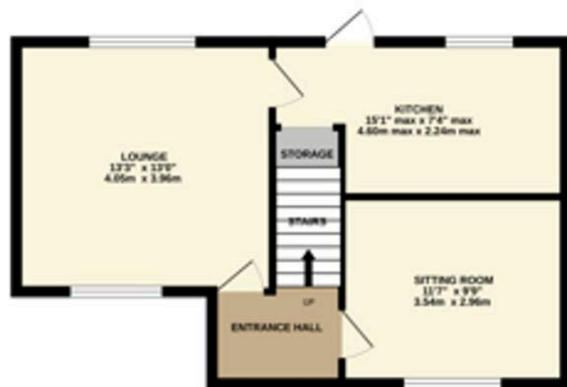
GROUND FLOOR 458 sq.ft. (42.6 sq.m.) approx.