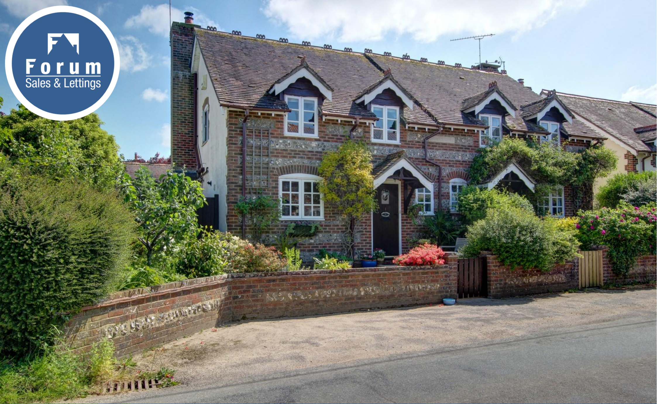
Apple Tree Cottage, West Street, Winterborne Kingston, Dorset, DT11 9AX