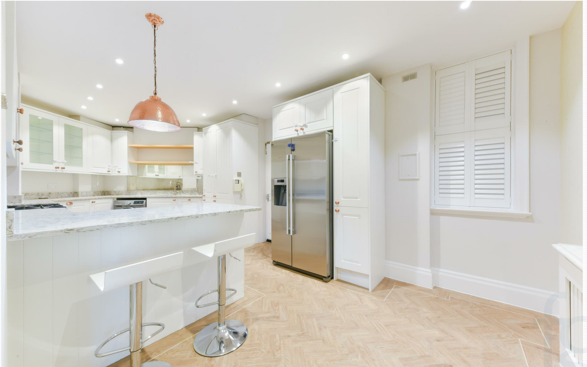
Onslow Square, South Kensington, SW7 3HU