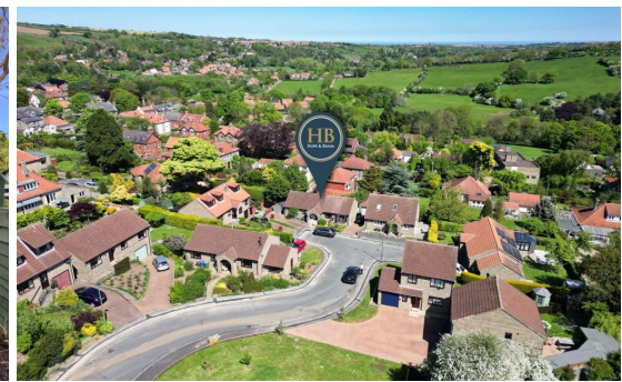
8 SMIDDYFIELDS, SLEIGHTS- 3 bed Detached Bungalow -£295,000