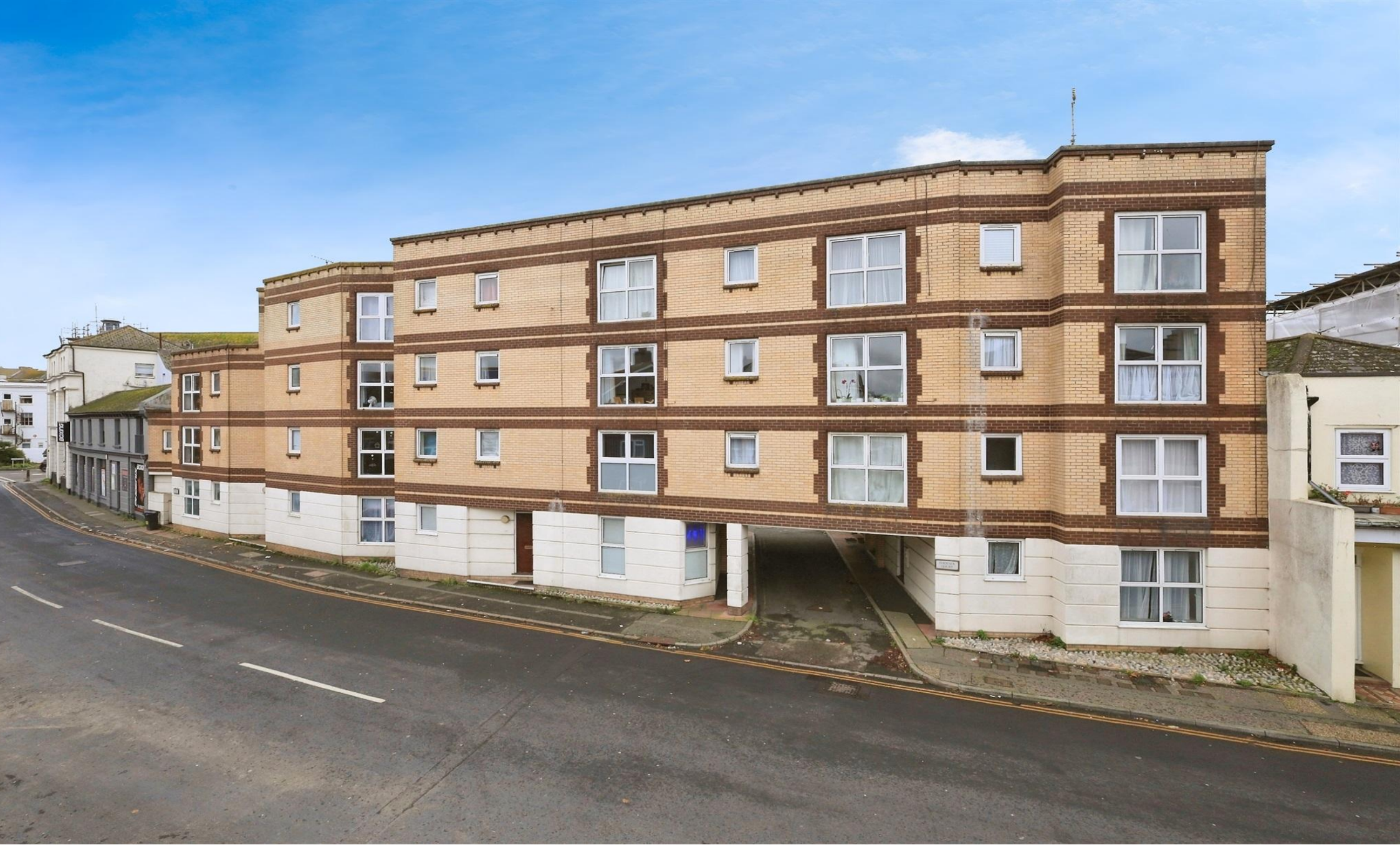
Phoenix Court Langney Road, Eastbourne BN22 8AJ