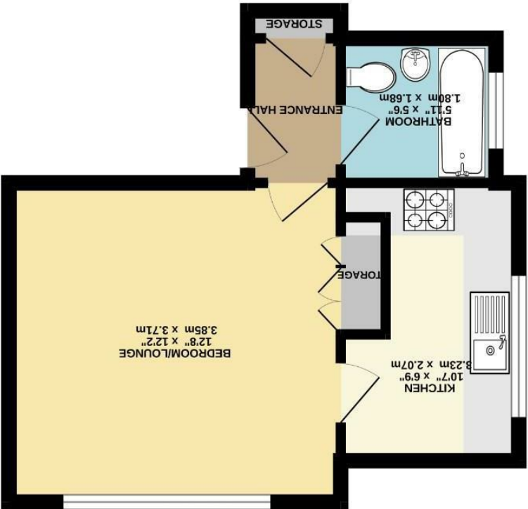
GROUND FLOOR 281 sq.ft. (26.1 sq.m.) approx.

These particulars are believed to be accurate but they are not guaranteed and do not form a contract. Neither Jordan Fishwick nor the vendor or lessor accept any responsibility in respect of these particulars, which are not intended to be statements or representations of fact and any intending purchaser or lessee must satisfy himself by inspection or otherwise as to the correctness of each of the statements contained in these particulars. Any floorplans on this brochure are for illustrative purposes only and are not necessarily to scale.