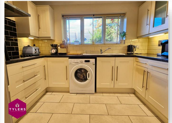
Ash Grove, Burwell, Cambridge, CB25 0DR