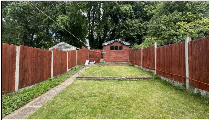
403 Rocky Lane, Great Barr, B42 1NL