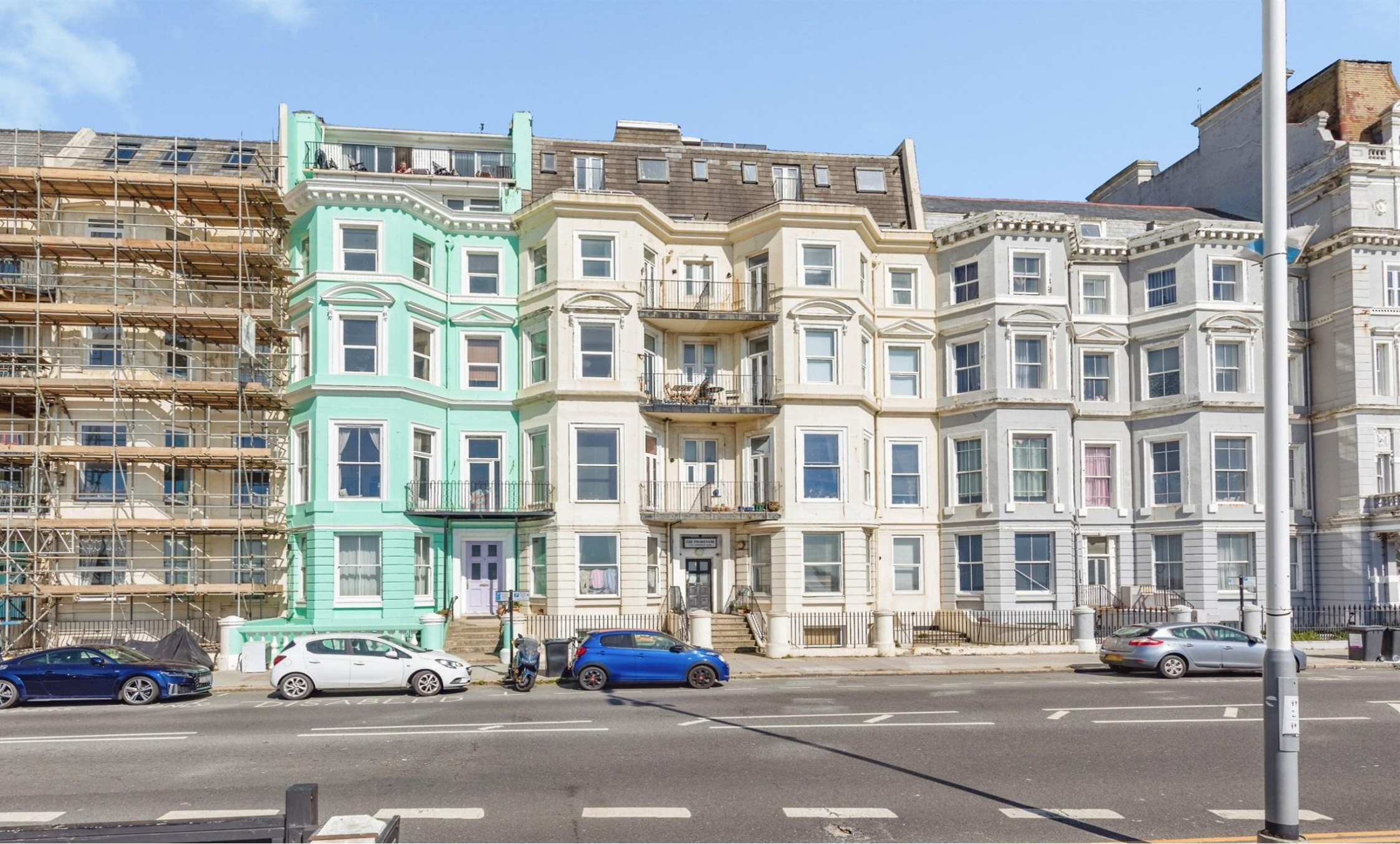
The Promenade Eversfield Place, St. Leonards-On-Sea TN37 6BZ