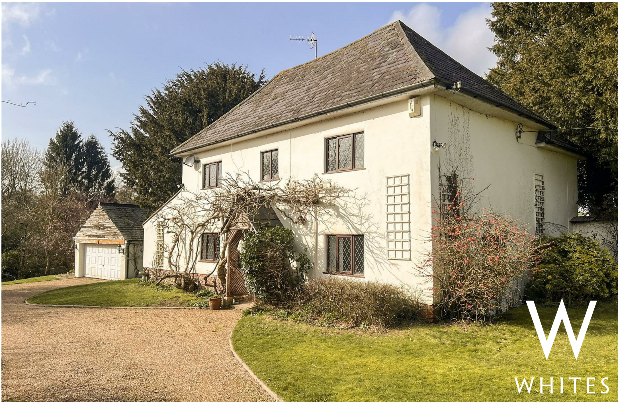
Primrose Cottage, Netton, Salisbury, Wiltshire, SP4 6AW