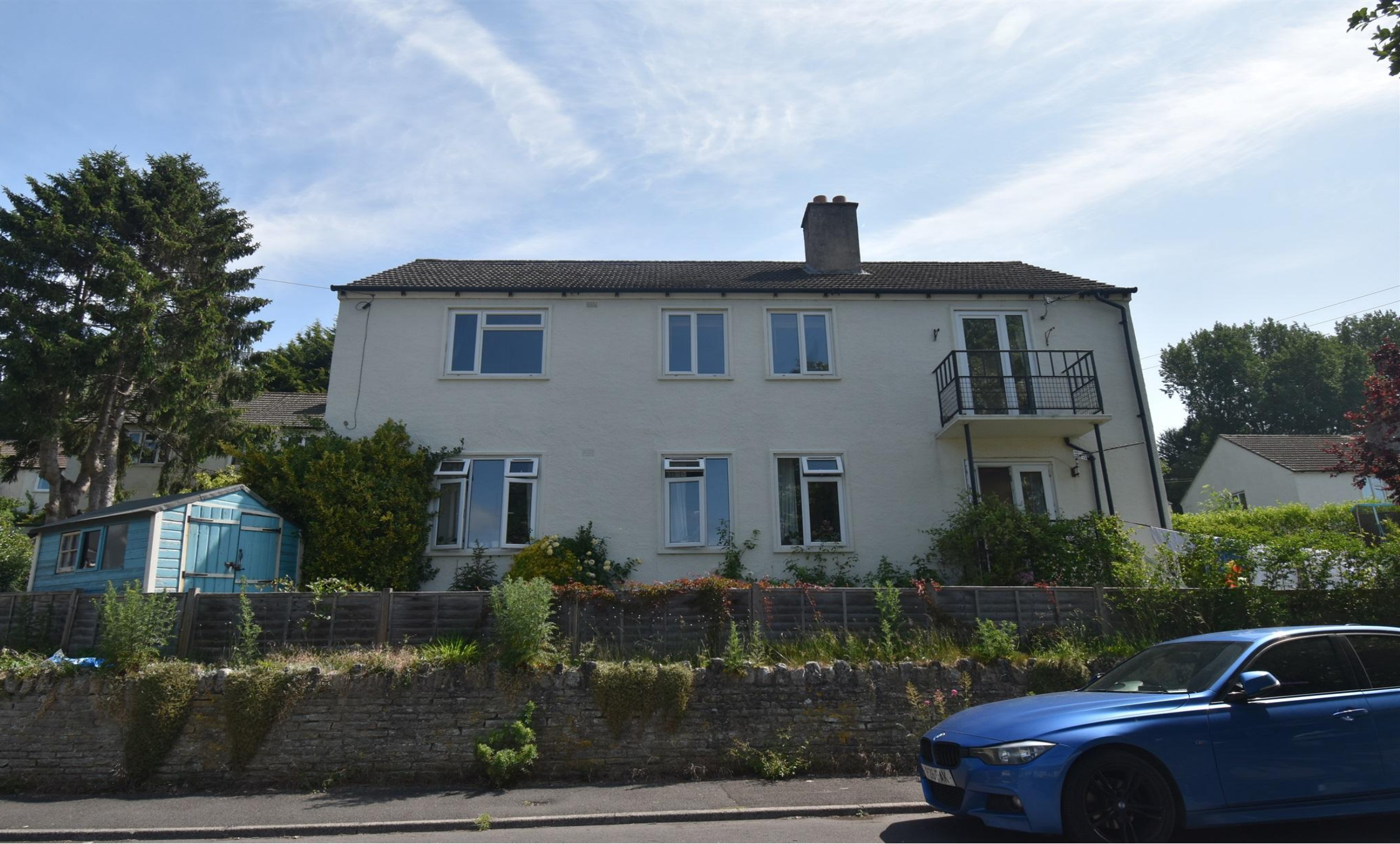
Elmhurst Estate, Batheaston, Bath, BA1 7NR