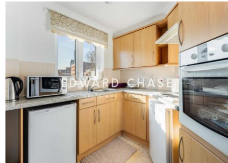
EDWARD CHASE MORLAND ROAD IG1 Approximate Gross Internal Area 46.24 m 2 / 497.72 sq ft