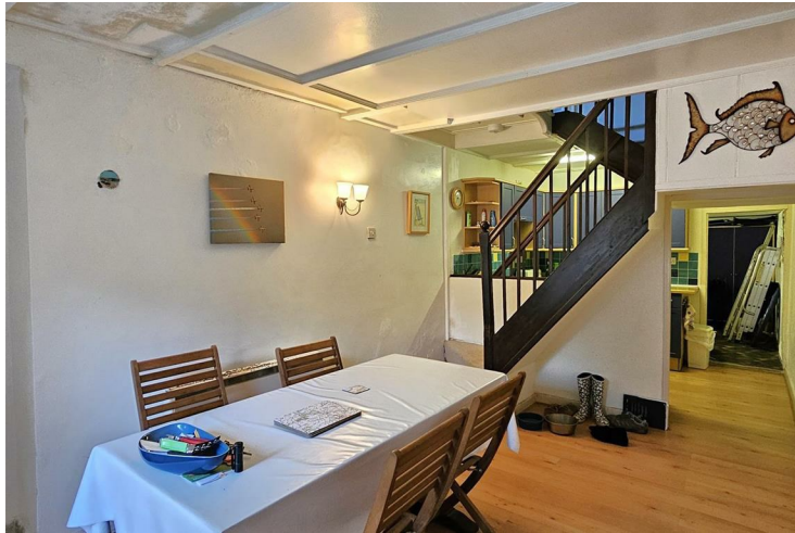
The sitting room and bathroom are located on the first floor.

The sitting room is a light bright room with decorative fire place and enjoys fabulous views over the roof tops to the estuary and Fowey beyond. The bathroom comprises of a bath with electric shower over, WC and wash basin. Storage cupboards house the hot water tank.