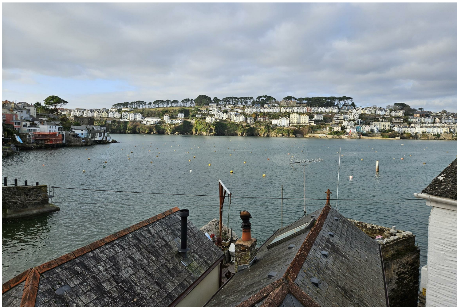
Harbour Cottage, 14 The Quay, Polruan, Cornwall, PL23 1PA