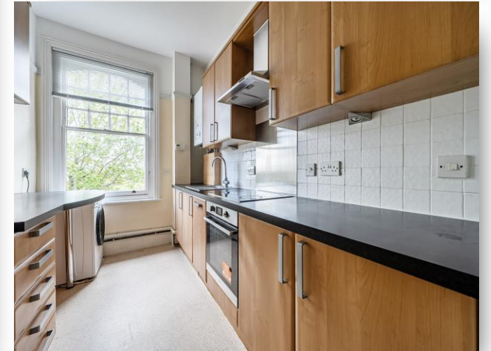
Flat 3, 5 Boyn Hill Avenue, Maidenhead SL6 4ET