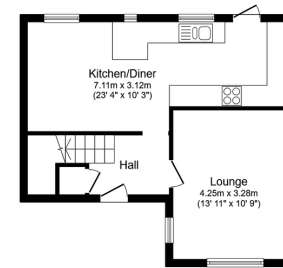
Ground Floor Floor area 41.7 sq.m. (449.2 sq.ft.)