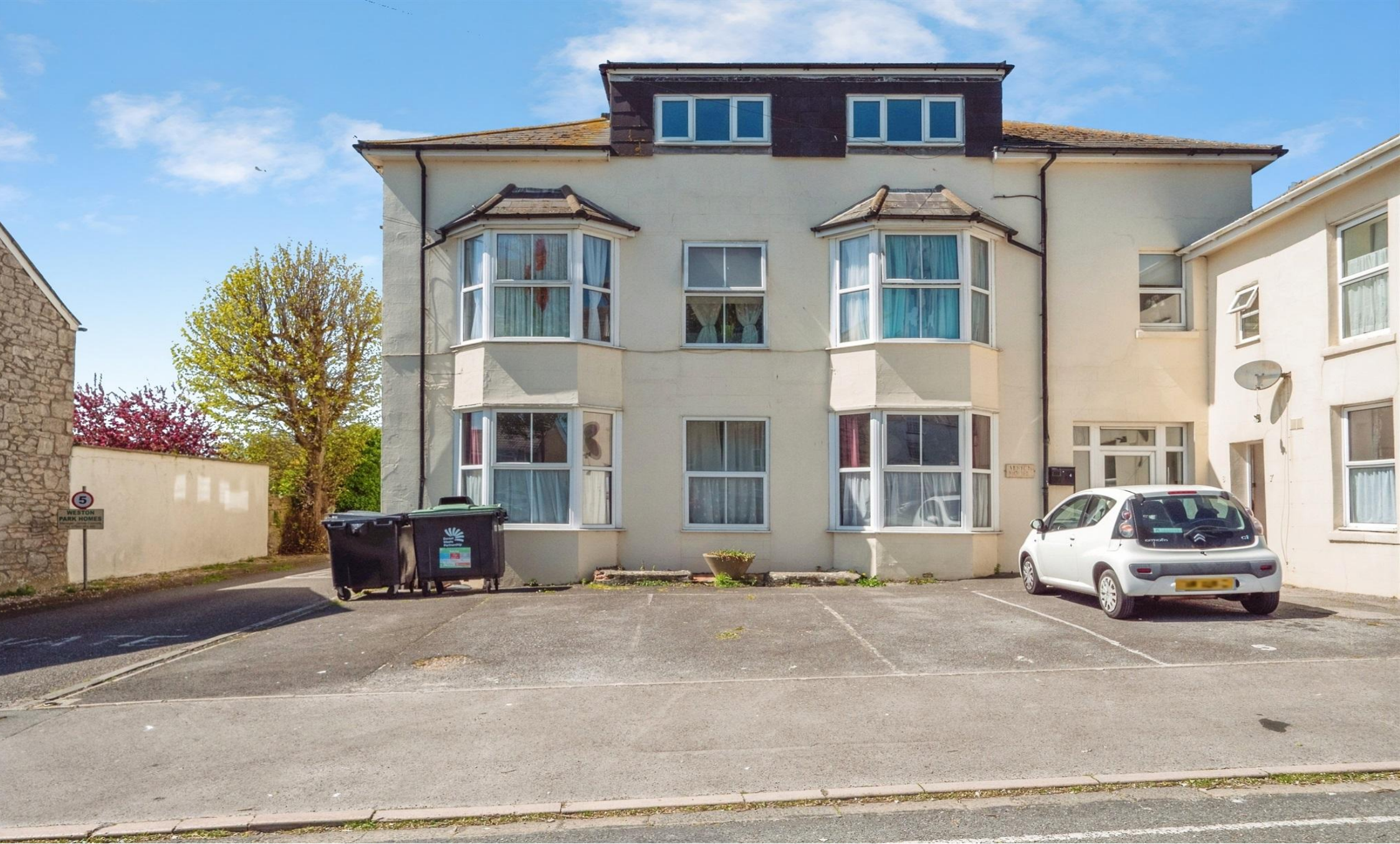
Weston House Weston Road, Portland DT5 2BZ