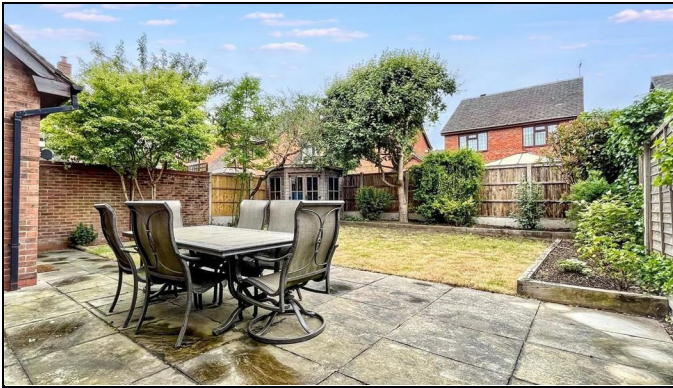
Shrubbery Close, Sutton Coldfield, B76 1WE