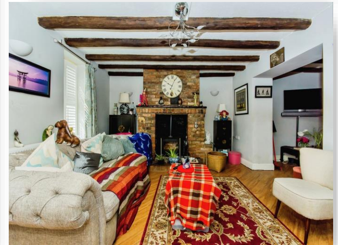
Town Street, Upwell Wisbech PE14 9DF