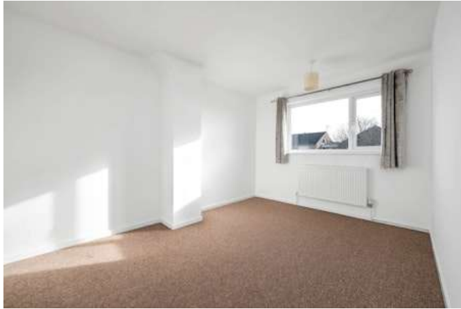
Entrance Hall 3.97m x 1.87m (13'0" x 6'1")