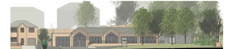
1 Proposed Street Elevation 1:200