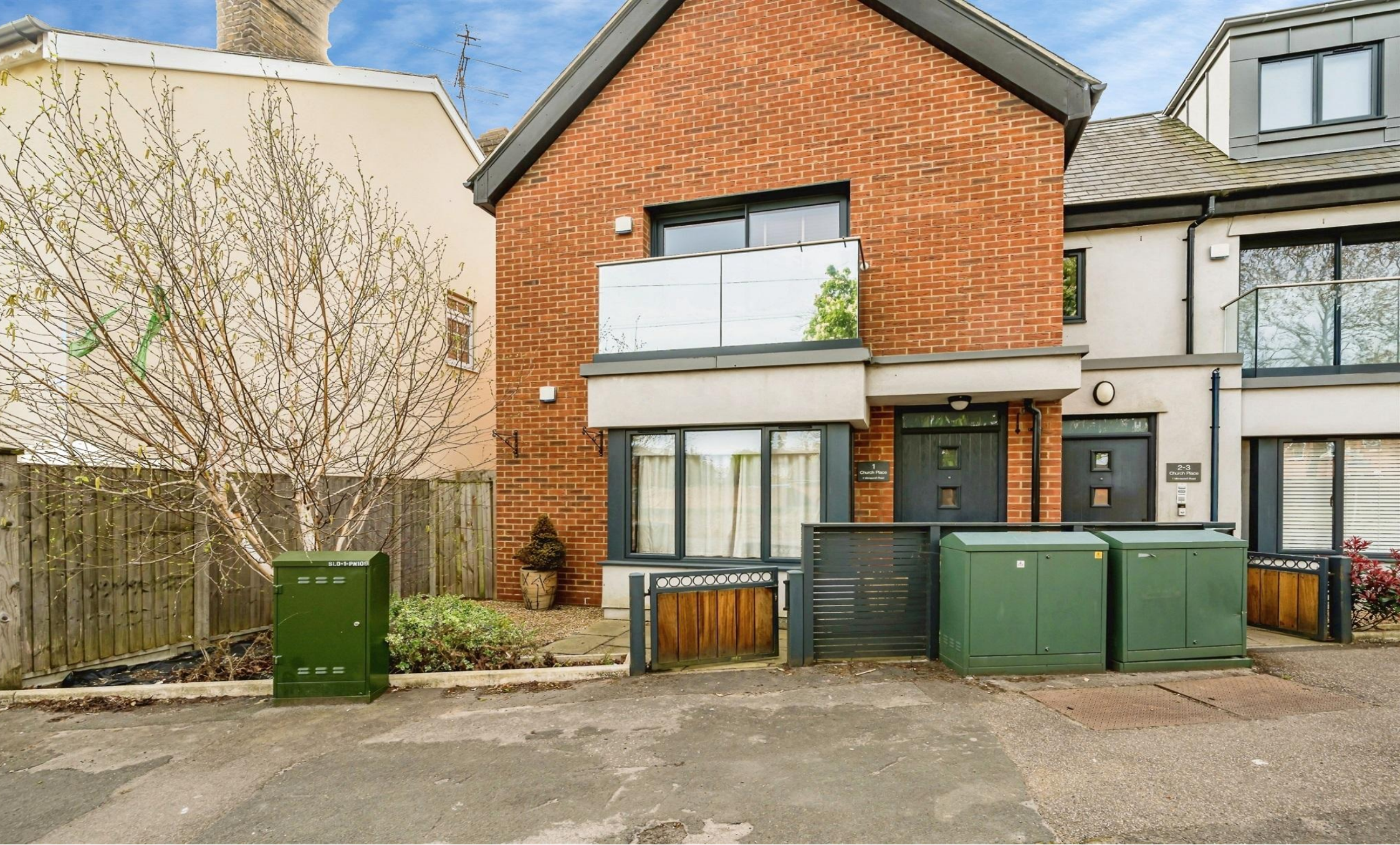
Church Place Minniecroft Road, Burnham Slough SL1 7DE