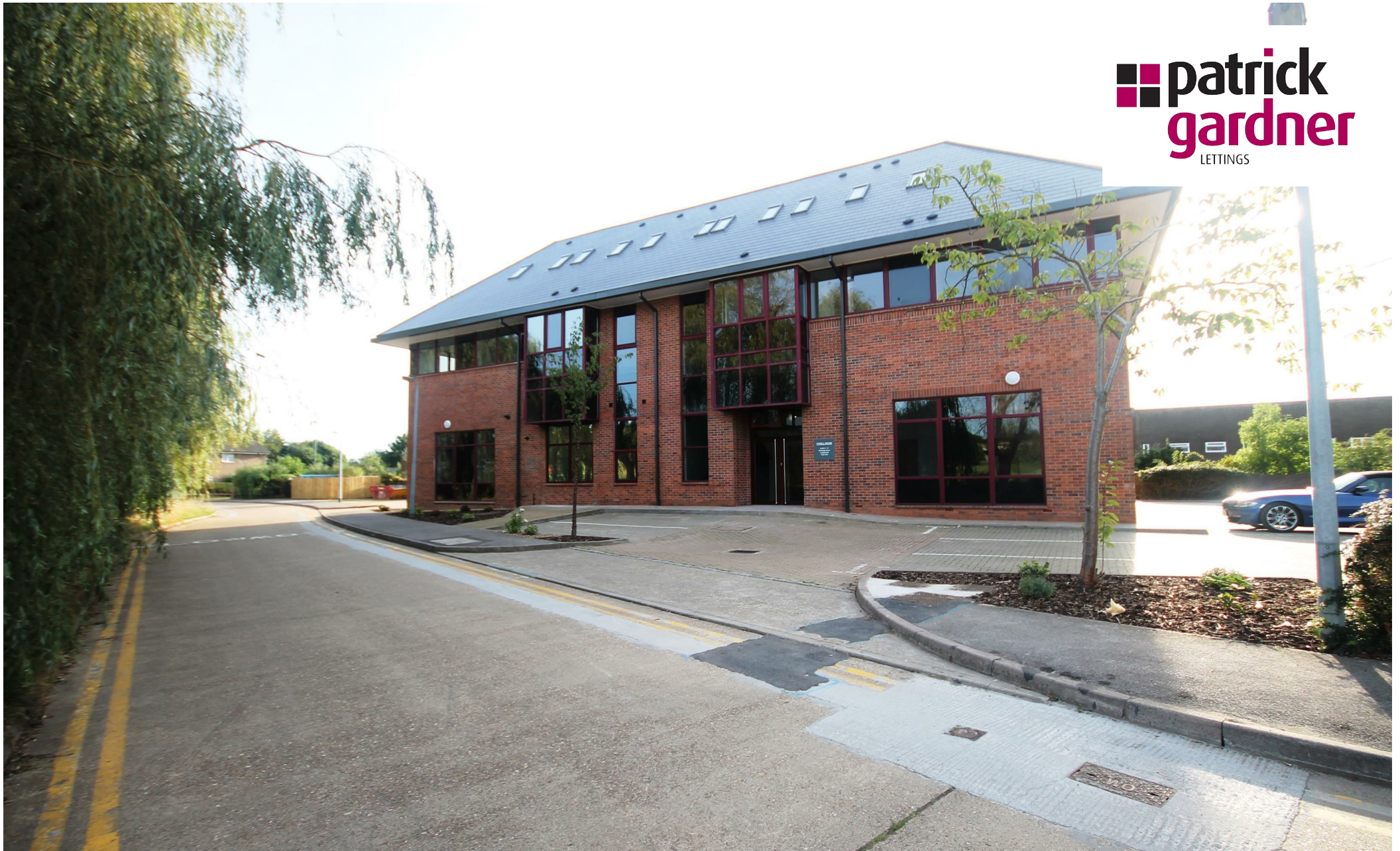
Challenge Court, Leatherhead, KT22 7FW