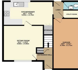
1ST FLOOR 533 sq.ft. (49.5 sq.m.) approx. Weekley